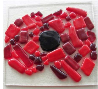
One of the finished Poppies