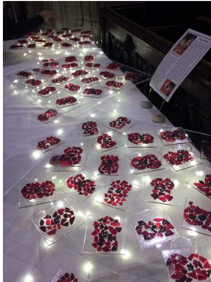
On display in the Church